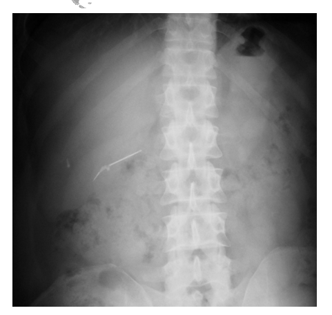
Figure 1. A foreign body resembling a packing needle in the region of the liver

A 41-year-old man was admitted to the hospital with a three-day history of dysuria and right flank pain. Physical examination revealed tenderness at the right costo-vertebral angle. Urolithiasis was suspected but abdominal X-ray showed a foreign body resembling a packing needle in the region of the liver (Figure 1). Abdominal tomography (Figure 2) and ultrasonography revealed right pelvicaliceal dilatation and a needle lodged in the right lobe of the liver. The proximal part of the needle was broken and located in the posterior curve of the liver. The patient said that he had never swallowed a needle, but that he had undergone surgery for the removal of another packing needle from under the skin of the right lower quadrant when he was seven. He did not give further details. He reported having no complaints before the ones related to his present visit. He was scheduled for follow-up visits without surgery, and two days later he passed a urinary stone and became free of symptoms.